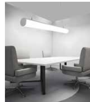
CQ series widely used in office, shops, living room, metro station and commercial building.